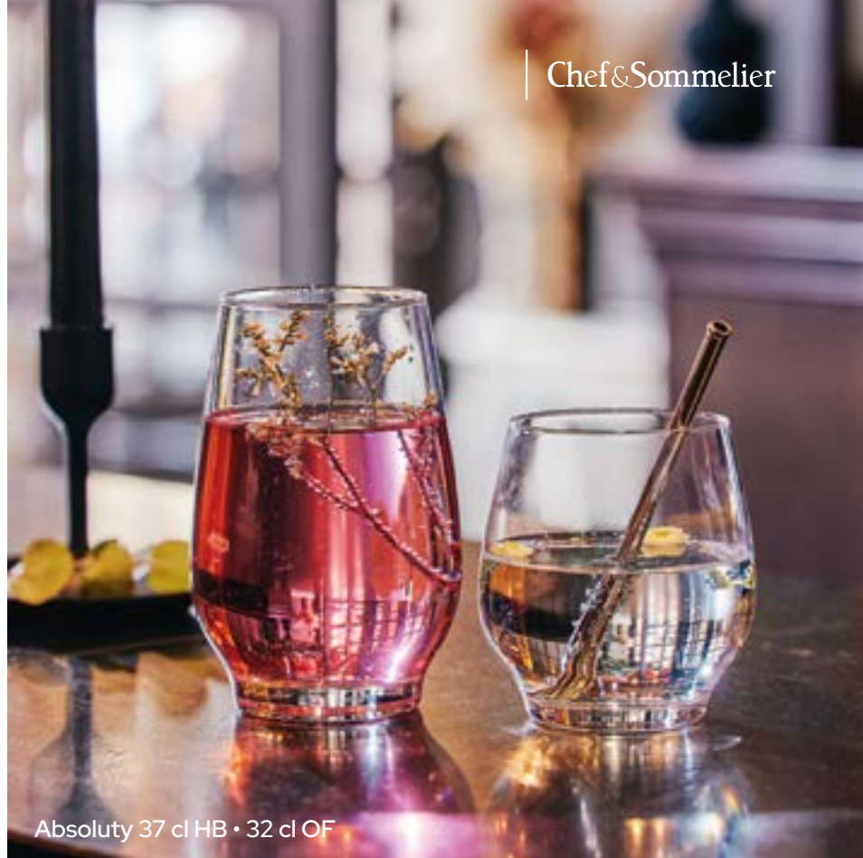
Absoluty 37 cl HB • 32 cl OF