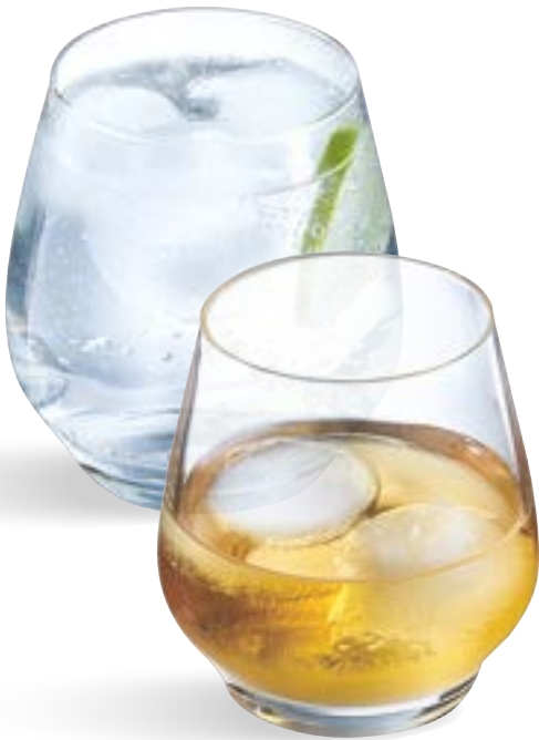
Absoluty 32 cl OF • 25 cl OF