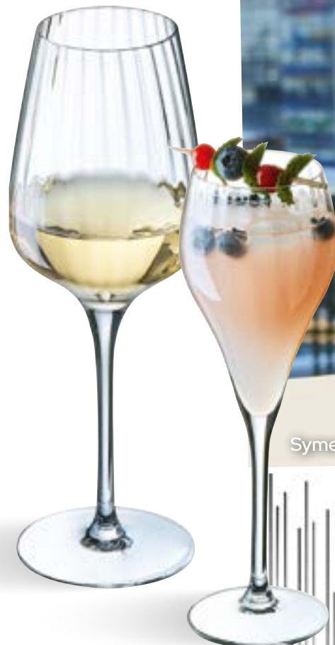
Symetrie 35 cl • 16 cl