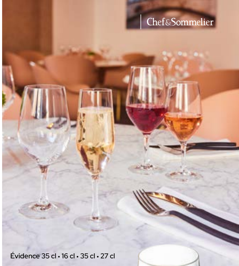
Évidence 35 cl • 16 cl • 35 cl • 27 cl

Thanks to its short leg and angular profile, complimented by the brilliance and finesse of Krysta™, the Evidence collection is the perfect mix of functionality and quality. This new range is clearly the new asset for bars and restaurants with a relaxed ambiance.