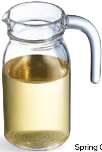
Spring 0,75 L