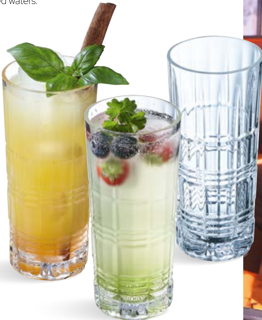
Brixton 31 cl Tubo

The Brixton collection brings back the authentic style of thick-bottomed structured tumblers. This balance between tradition and modernity will inspire mixologists and bartenders when creating new cocktails. The mouldings of the glasses bring a touch of sophistication to a bar and highlight any style of cocktail or spirit. The new Tubo is ideal for serving sodas, fruit juices or flavored waters.