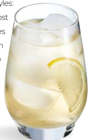
Absoluty 37 cl HB