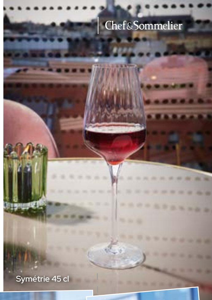
Symetrie 45 cl