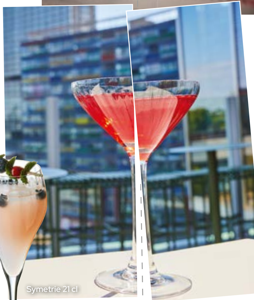
Symetrie 21 cl