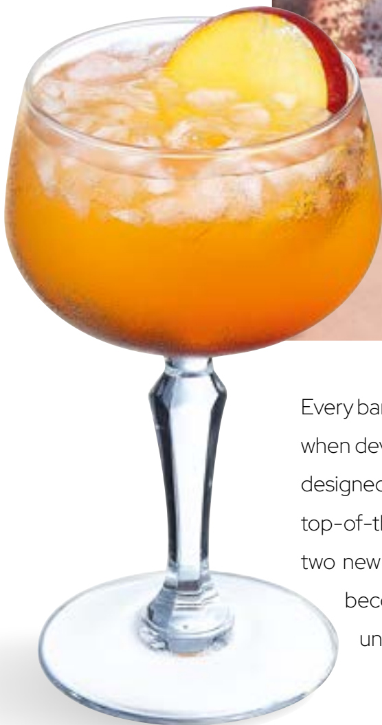
Monty 27 cl